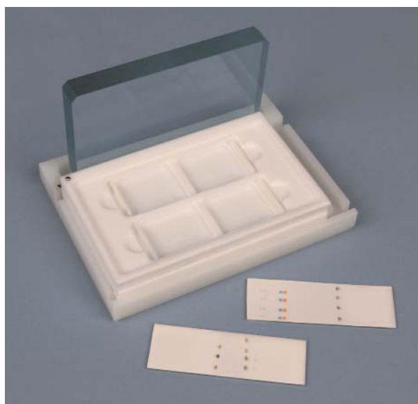
Figure 1 - UniFlash Planar Station

The UniFlash Planar Station consists of three main parts - the base, the plate holder, and the glass cover. The base is designed with 4 separate development solvent wells. Each well holds up to 1ml of mobile phase. The Teflon® plate holder holds two microscope slide size thin-layer plates. Each of these plates contacts two separate solvent wicks located at each end of the plate. These porous wicks transfer development solvent from the wells in the base onto the plates. The cover is a ½” thick glass plate. The glass cover is positioned on the plate holder, forming a vapor seal around the chambers containing