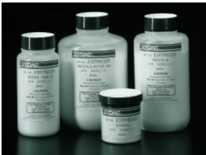
"Dynamic Axial Compression" is a trademark of Prochrom. "Annular Expansion" is a trademark of E. Merck.

Because they are chemically identical to Vydac's analytical adsorbents, Vydac process chromatography products are ideal for developing high resolution purification procedures for biopharmaceuticals. Research scale columns can be used to develop purification procedures in the laboratory for pre-clinical samples with the assurance that when clinical trials begin the purification procedure can be easily scaled up to 2 inch (50 mm) or 4 inch (100 mm) diameter columns to purify gram quantities of peptide. After PLA approval, Vydac Process Chromatography products can continue in the product stream in columns of 4 inch or larger or as bulk material in specialized column configurations to ensure long-term delivery of quality biopharmaceutical products.